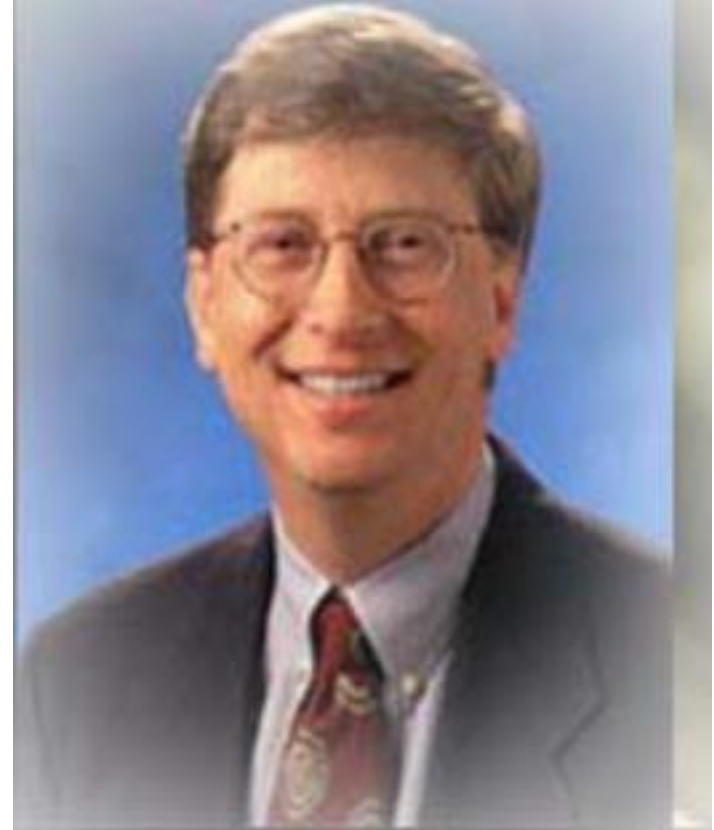
a computer programmer