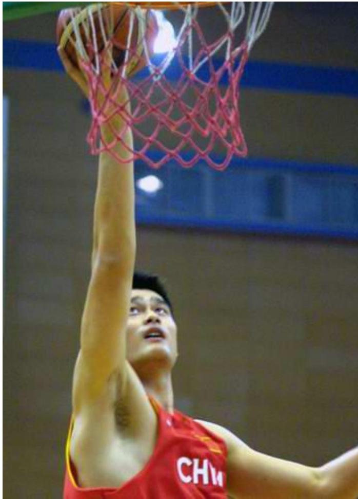
a professional basketball player